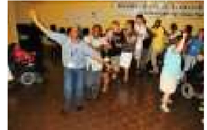
Maryland Youth Leadership Forum "Where Leadership Takes Flight"

We encourage eligible students to be a part of the YLF program not only to learn valuable leadership skills, make new friends from all over Maryland, but also to learn how to speak-up for themselves. Each student that has completed this program has spoken of a better understanding of their own disabilities and the disabilities of others. They make it clear how much this program has helped them become strong, capable young adults. They also comment on the life-long friends they have made through this opportunity.